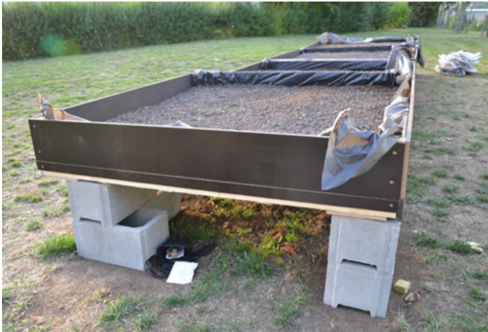
2: Experimental plots of green roofs in Mendel University Campus, photographed on a day of establishment, vegetation is in a phase of sowing, due to this substrate layer is visible August 2015; photo: by author)