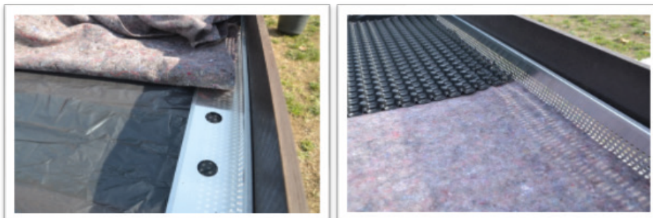
3: Detail of green roof layers – protective water storage fabric (on the left) and drainage nep film (on the right); photographed on a day of establishment August 2015; photo: by author