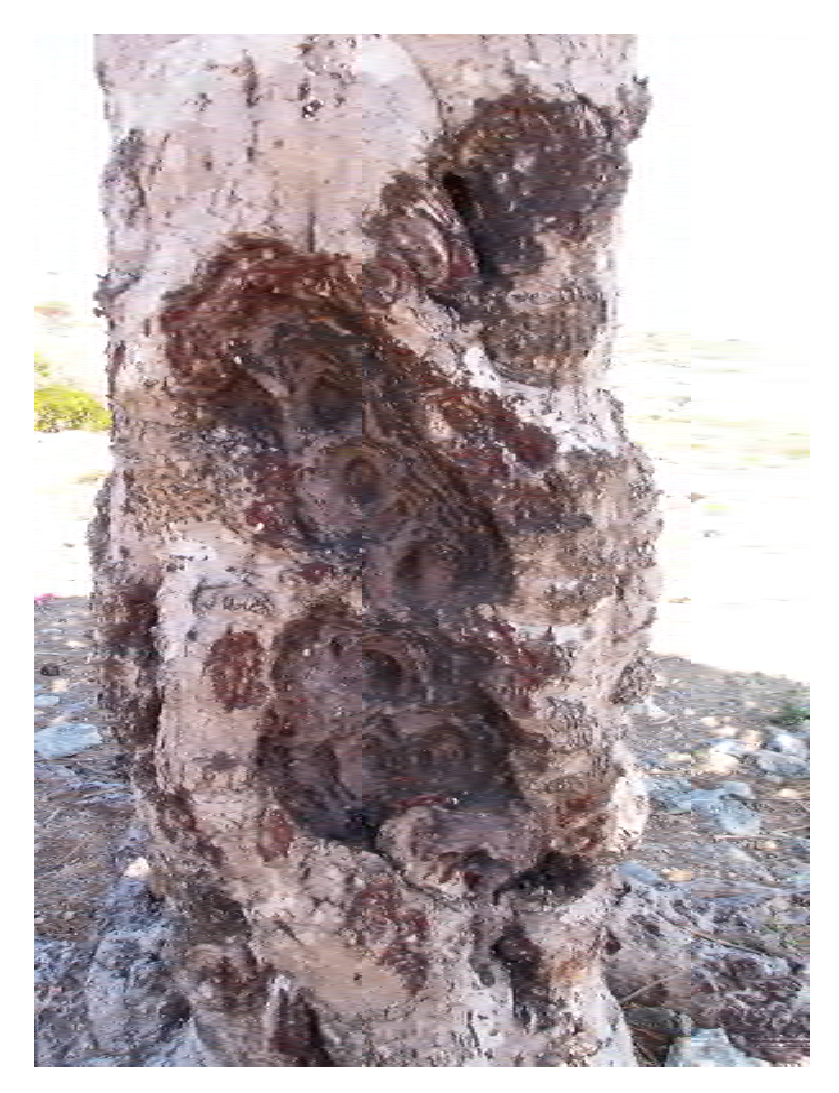
Figure 4. Typical wounded stem of a dragon tree, causing mistakes in repeated DBH measurements (P. Maděra, 2021).

negative values. Variability within the 95% confidence interval includes that caused by this error in repeated measurement. Removing negative values from our model resulted in an increase in R^2 to 0.1, which means that the model explained 10% of the data variability. However, we considered using negative values in our model, because the same DBH measurement error could have been made with positive values.