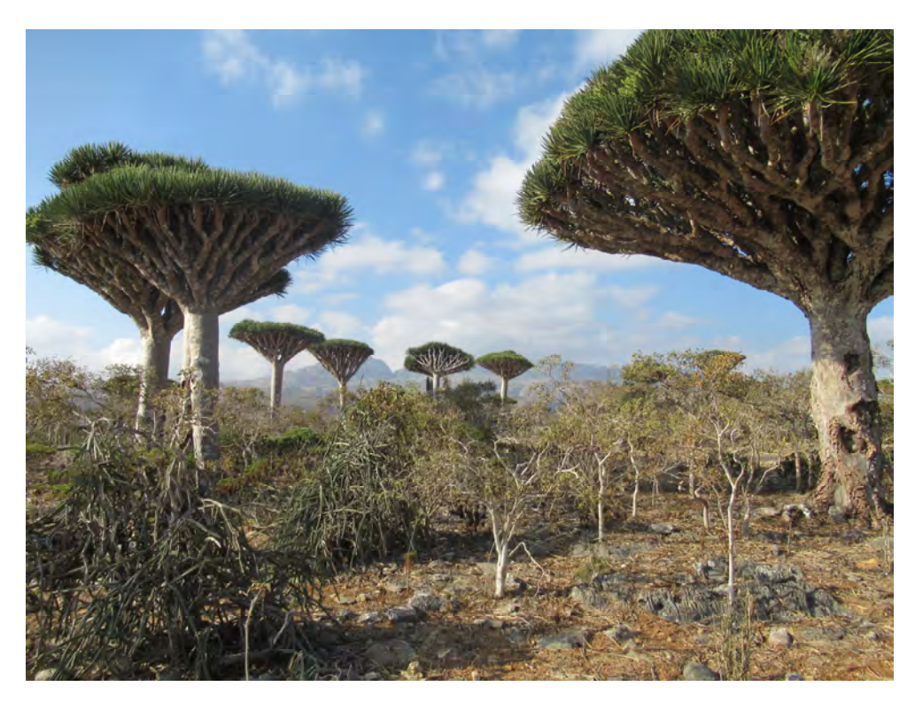
Figure 2. One of the monitoring plots in Firmihin (L. Bauerová, 2021).

ArcGIS Collector app helped with navigation by GPS using a mobile phone. The DBH classes (in Results section) were derived from the DBH measured in 2011. Overall, 90 plots were visited, and 1077 trees were measured in total. Seventeen monitoring plots were not measured, for different reasons. Some of them were destroyed by landslides caused by cyclones in 2015 and 2018. In some cases, we were not able to identify the measured trees within the plots, especially in those with high tree density, because the accuracy of the mobile GPS was insufficient to find the exact positions of the plot centers which were needed.