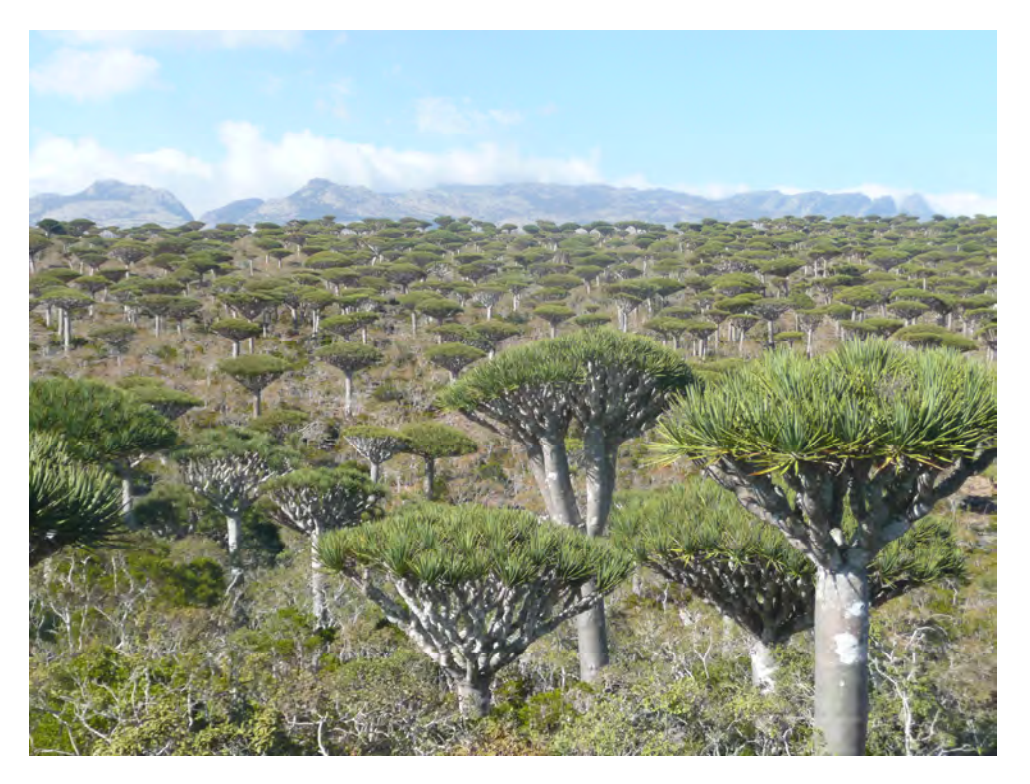
Figure 1. Part of the D. cinnabari forest on Firmihin Plateau.

The measurements were conducted in Firmihin, which is described as a limestone plateau [37] situated in the central–eastern part of Socotra Island [16]. The largest dragon tree forest in the world can be found here [16] (see Figure 1). The D. cinnabari forest in Firmihin is also unique to Socotra Island because this species is quite scattered in other areas. Firmihin reaches an altitude of 400 to 760 m a.s.l. [16,20]. The mean annual temperature is 23.4 °C, and the mean annual precipitation is 344 mm [39]. In terms of vegetation, the evergreen shrub Buxanthus pedicellatus Tiegh. also grows, forming the Buxanthus–Dracaena community; however, D. cinnabari predominates [14].