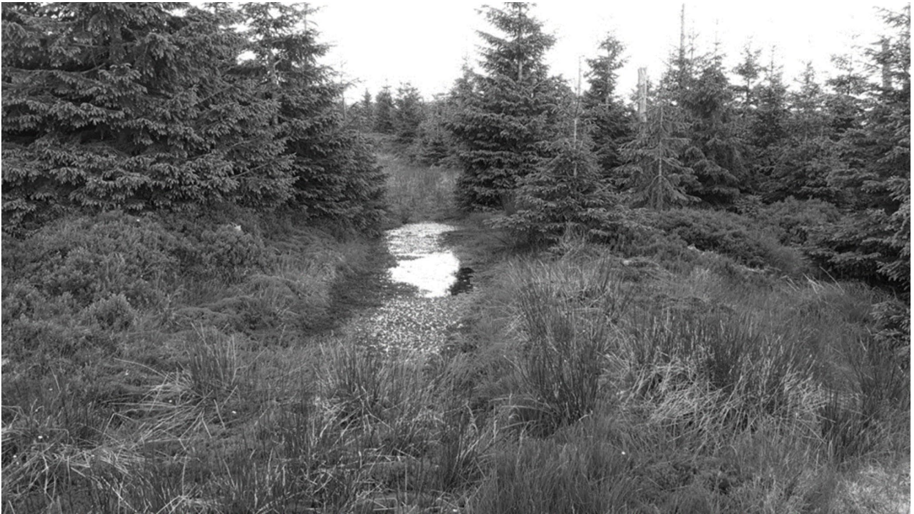
Fig. 2 Artificially created pool in an abandoned forest path inhabited by Alpine Emerald ( Somatochlora alpestris ). The image shows the pool with the highest abundance of the species, where 30 larvae of different instars, several exuviae and a patrolling imagoes were recorded.

repeated successful use of artificial aquatic habitats by Salp. The inhabited pools were small with a maximum area of 20 m 2 and depth 70 cm. Typical was a bottom with deep muddy layer (even tens of cm) and richly developed riparian vegetation, where peat and polytrichum moss, together with sedges were significantly represented. Pools with Salp were typically colonised by other species such as A. juncea , A. cyanea and P. nymphula (Table 1). In contrast, unoccupied pools were usually dominated by coarser substrate in the bottom (gravel, stones or a layer of fallen wood) and were still disturbed (car runs and mud wading animals). The banks were sparsely vegetated (sometimes almost barren), usually dominated by Juncus sp. and Avenella flexuosa , and were not colonised by other dragonfly species, except from A. cyanea in one pool (although Salp males were sometimes observed patrolling here). Another tyrphobiont species as A. subarctica and L. dubia were not recorded at artificial pools (Table 1).