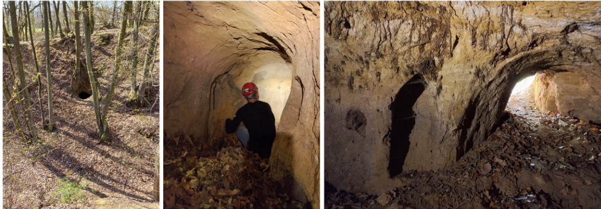
Fig. 2: Dugout 1 - northeastern entrance (on the left) and its inner spaces (in the middle); Dugout 3 - inner spaces with a stove niche (right)

traces of the tools on the inner walls confirms the sophisticated way of digging and shaping the spatial disposition, but every dugout is quite specific. While Dugout 1 is formed by two rounded cavities, Dugout 2 and 3 are rather square. Dugout 2 has remained unfinished according to the horizontal excavations on the back wall, which would probably serve as ventilation or a second entrance. In Dugout 3, horizontal boreholes are incorporated perpendicular to the direction of the entrance corridors, and with regard to current knowledge, they thus lead into the unknown. For now, it is not excluded that they can connect to other, yet undiscovered spaces.