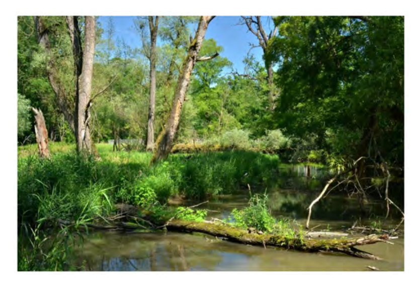
Figure 4. The mosaic of floodplain habitats is also cocreated by Willow–poplar forests of lowland rivers, tall-sedge beds, Eutrophic vegetation of muddy substrates, etc.