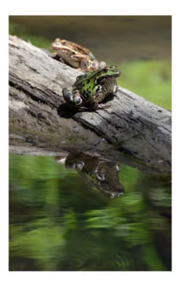
Figure 3. Which are the habitats of many specially protected plants and animals (e.g., Rana sp.).