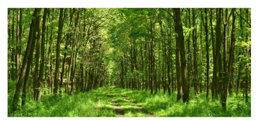
Figure 7. The result of the clear-felling system of forest management is even-aged and monocultural stands of deciduous, mostly autochthonous, tree species (oak, ash).

The area of the Protected Landscape Area Moravský Kras is located in cadastral areas of 24 municipalities. However, only the cadastral areas of the municipalities of Ostrov u Macochy and Rudice overlap completely with this protected landscape area. According to the data of the Czech Statistical Office, as of 1 January 2015, the population was 24,850 inhabitants. For the share of economic subjects in chosen administrative areas