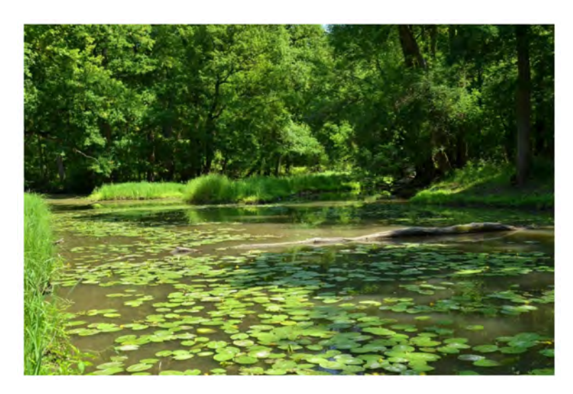
Figure 2. The floodplain forests in the Soutok area are interwoven with a network of river branches, billabongs, canals, etc.