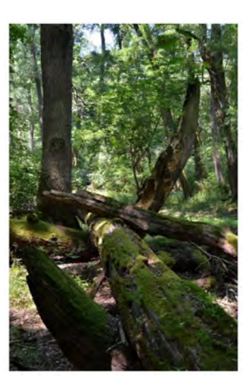
Figure 5. The most valuable parts are of primeval character with a lot of woody debris.