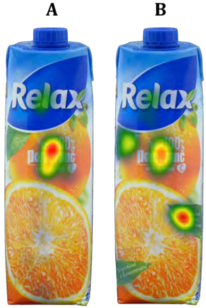
Figure 3 Heat maps of tested variants juice Relax with and without additional informations.

In this case of the eye-tracking research, we tested the assumption that when placing additional information from