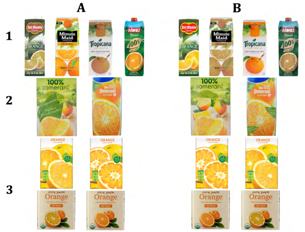
Figure 1 Variants of stimuli used for A/B test.

The first stimulus consisted of a selection of 4 juices, 2 of which were colored normally and the remaining two had their color saturation reduced by 50%. Based on the data of individual metric, it has been recorded that the color saturation had an impact on the number of returns to a certain juice. The largest difference has been recorded in juice brand Tropicana, where the respondents looked back 3 times at the version with lower color saturation, while the normally colored version caught their attention more than 5 times. In case of juices Minute Maid and Tropicana, the most observed area of interest was the brand, while for the remaining two juices Del Monte and Dimes it was the flavor labeled 100%.