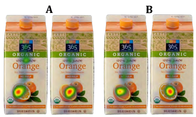
Figure 4 Heat maps of tested variants juice 365 Everyday Value with photo and illustration of oranges.

For the first stimulus, juice 365 Everyday Value, it is clear from the heat maps (see Figure 4) that respondents were primarily driven by orange images during the decision process. This is also confirmed by the authors Simmonds and Spence (2017), who confirms that food images can evoke hunger or craving for food in the consumers' minds. The average percentage values of dwell time for individual areas of interest are shown in Table 3, which shows that the participants spent most of their time looking at pictures of oranges on the juice packaging. They spent up to 30% of their total viewing time by looking at orange images.