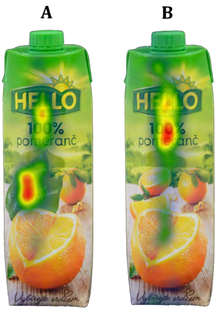
Figure 2 Heat maps of tested variants juice Hello with and without additional informations.

Based on the heat maps in Figure 2, it is clear that the graphic edit of the front side of the packaging drew significant attention from the respondents. Figure 2 also shows that attention paid to additional information increased at the expense of the sign "100% pomeranč" (100% orange) and the image of an orange. The most viewed part of the front side was leaves with information (37.5%), while with the original package without any edits it was the brand name (21.9%). Great attention while viewing the front side of the package was also paid to juice flavor along with the 100% sign, which the respondents in