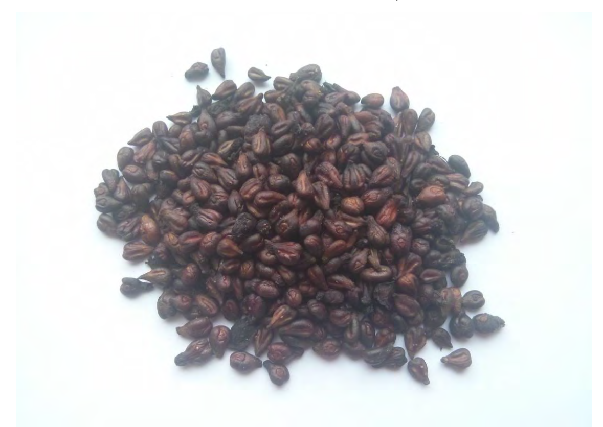
Figure 1 Grape seeds (Vitis vinifera L., cultivar Marlen).

A 1500 \mu L volume of the ABTS reagent (7 mM 2,2'-azinobis-3-ethylbenzothiazoline-6-sulfonic acid) and 30 \mu L of the sample (extract from the grapevine seeds) was pipetted into the cuvette (3 mL). The mixture was incubated at ambient room temperature for 30 minutes. After this time, the absorbance was measured at 734 nm.