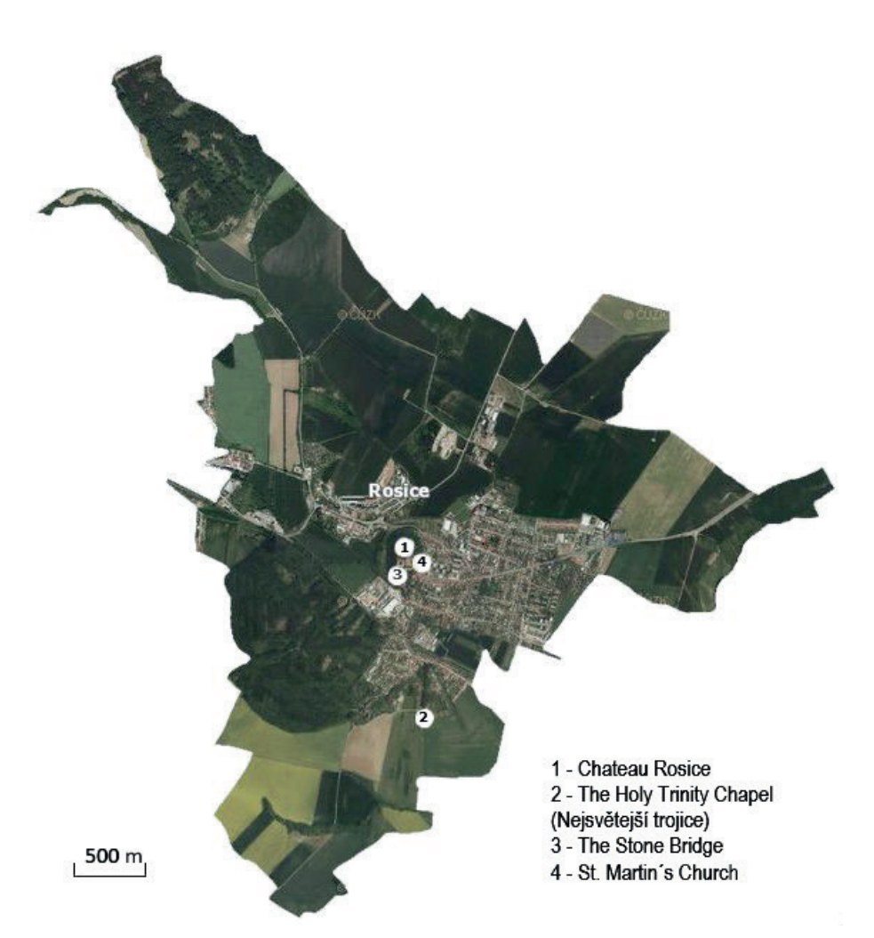
4: Landscape components suited to preserved for the next generation

grasslands, streams, and trees that line roads as well as castles and chateaux, churches and small-scale sacral constructions.